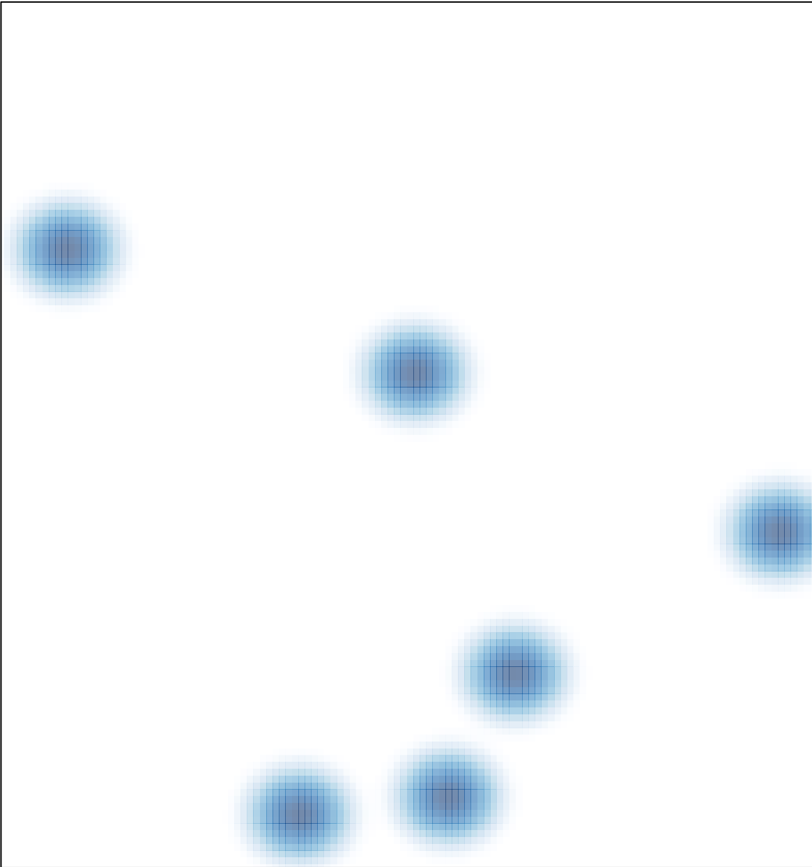
# features = 6 , max = 1